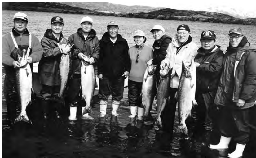
August 1998, fishing for king salmon in Kodiak, Alaska. I am fourth from the left, next to my wife. Church leaders are on either side.