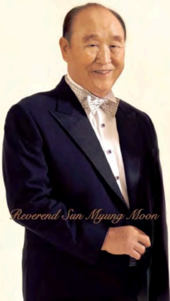
Reverend Sun Myung Moon