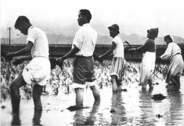
Early spring 1959 in Yamok, Kyeonggi Province. I took the members to help plant rice. The farmers benefitted, and for us it was training.