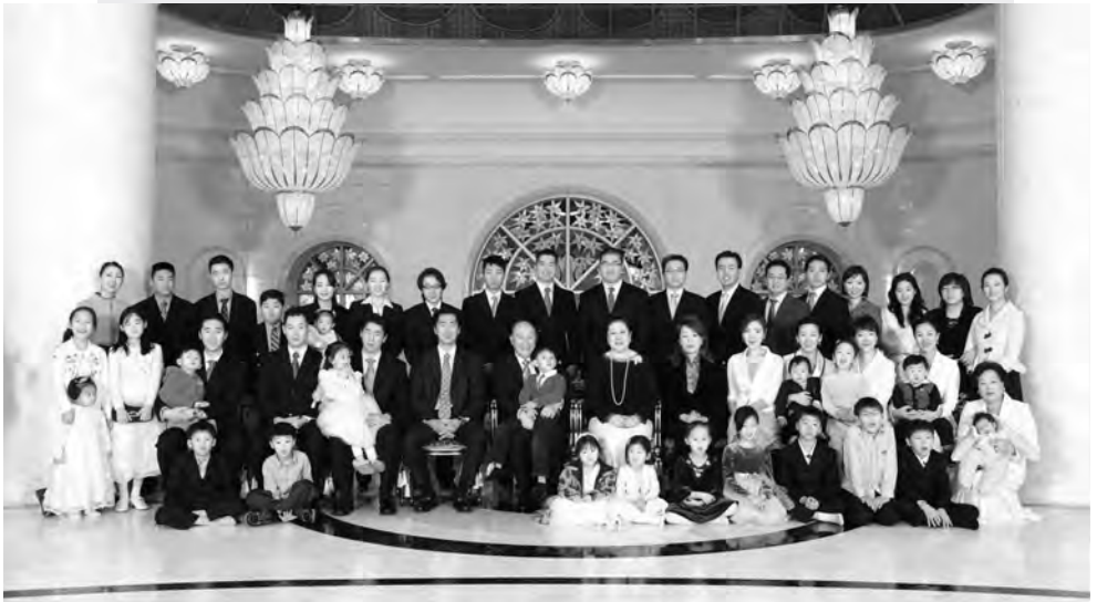
Even this family portrait taken in Korea on January 1, 2009, doesn't include everyone. We have 14 children, living in different parts of the world, and an ever-growing number of grandchildren and great-grandchildren.