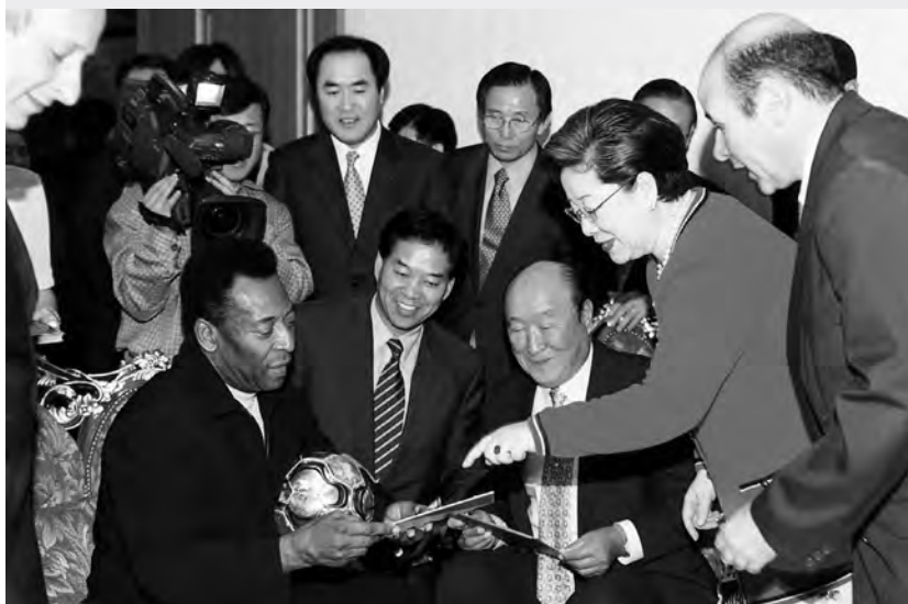
On June 4, 2002, soccer great Pelé paid a courtesy visit to my residence in Hannam-Dong. Here my wife explains the World Peace Cup Soccer Tournament. I shared with Pelé the vision of promoting soccer as a way to build bridges of peace between nations.