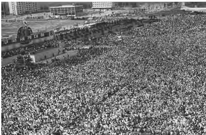
More than 1.2 million people attended the World Freedom Rally in Seoul's Yoido Plaza on June 7, 1975.